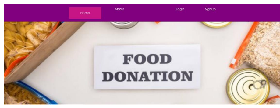
Figure 03: Homepage of the website

information of this website by clicking on the about menu. Both donor and charity organizations have to be registered using sign up menu. Only the registered users can log into their account using login menu. For this they have to put username and password in the login page. After that the users can provide any kind of information or write the post.