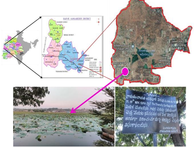
Fig. 1.1 Loaction of the Study Area

Bandam Kunta lake is selected as Biodiversity Heritage site under G.O.Ms.No.70 on 15-11-2016 from Telangana state.