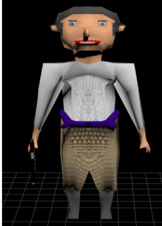
Fig 1. Character Development

Various levels of detail and animation can be provided to the characters. These can be coded later as well. Fig. 1 shows a sample character developed for the game.