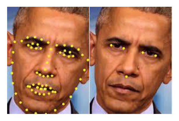
Fig 2. Face landmarks pointing

In Fig. 1. Flow cart is made for show the working of the project. The working is, when the user runs the program, the webcam that is placed in front of the driver starts detecting the face and then eyes. Then the program will extract the data from the webcam and then detect if the eyes are closed or opened. If the eyes are closed then the system will play sound so that the driver is awaken. If the eyes are opened then the system will goes on repeating the program. The process will go on.