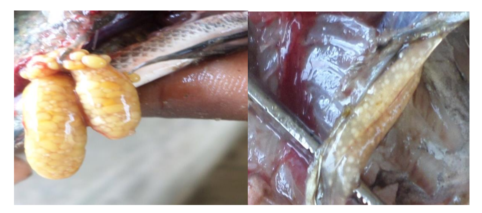
Figure 1: enlarged ovaries

The presents figure represent the resulting degree of gonad differentiation observed and recorded for sexually mature tilapia that received various experimental diets. Figure1 and 2 represent a comparison of normal and abnormal gonad differentiation observed in sexually tilapia that received various experimental diets over a period of 4months