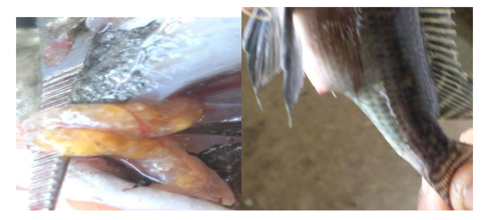
Figure 2: abnormal ovaries