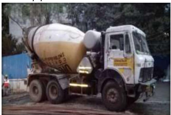
Figure.No.4. Transit Mixer 4.4.1