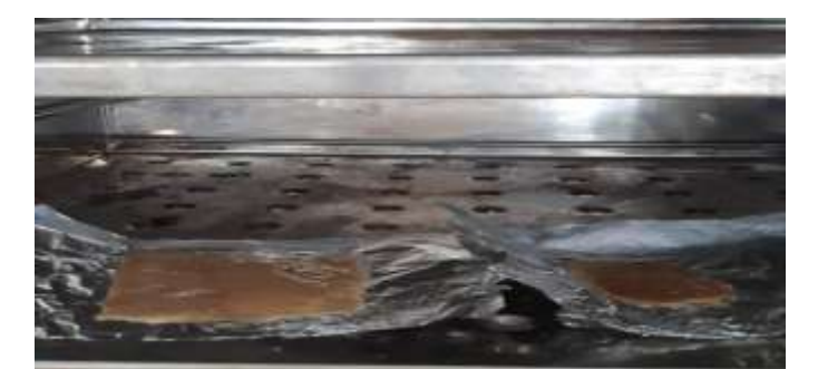
Figure -3 Drying the film in hot air oven