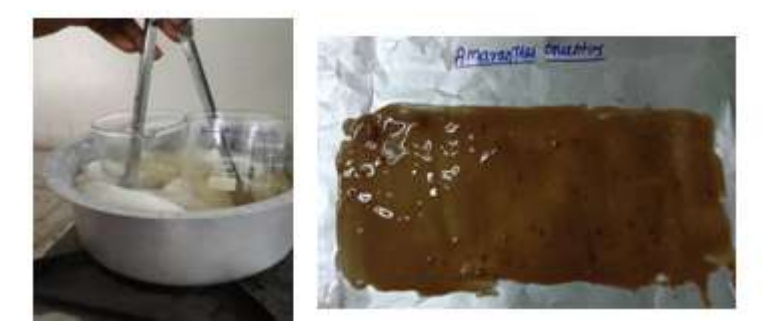
Figure-1 Heat of the mixture Figure -2 Spread over the Sheet

Take require amount of starch in a beaker, soak it in distilled water for few minutes. (0.5N) HCL is added to this mixture and stirred using glass rod. Plasticizer (glycerol) was added to this mixture and stirred. Now the pH was checked (pH7). 0.5N NaOH is added according to PH desired. Then added gelatine for more adhesiveness for film. The mixture was heated (Figure 1)in low temperature for 10 minutes until the mixture become gelly in nature. The gel was spread on aluminium foil (Figure 2). Then it was allow to dry in a hot air oven (Figure 3)for 3 days in 40°C.