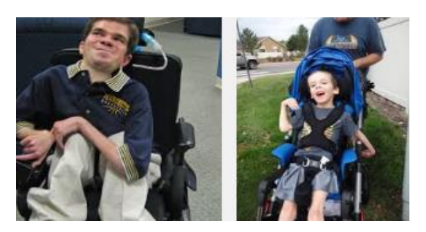
Figure 4 Duchenne muscular dystrophy

The advent of the 20th century brought with itself enormous prosperity for American Botanist Thomas Morgan and his colleagues. Among his most striking works are the insights into X linked Inheritance. The due diligence of Morgan in this field also put forth many interesting questions about the sex chromosomes; aberrations in which could lead to crippling, often lethal diseases.