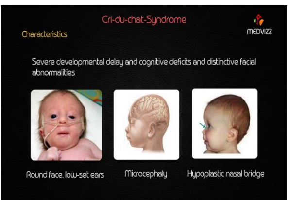
Figure 1 Cri Du Chat Syndrome

chromosome, whereas the latter due to deletion in the long arm of chromosome 15.