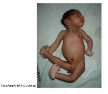
Figure 2 Edwards Syndrome

Edwards disease affects the infant's mental and physical growth, breathing and feeding, and proper functioning of the kidneys, intestines, and heart whereas Patau syndrome is associated with neurological defects, mental and motor insufficiencies, polydactyly, along with defects of the heart, eye and spine.