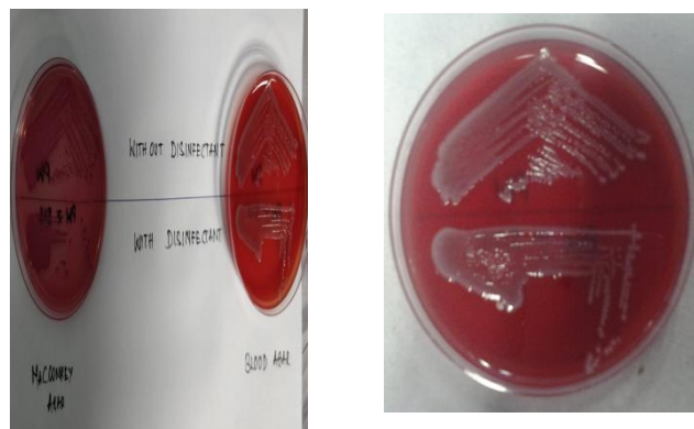
Fig3: Validation of anti-bacterial properties

The sample is provided to the lab and the generation of the report clearly shows that bio-enzyme based product stops the growth of the bacteria.