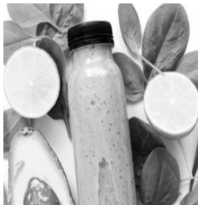
Fig2: Bio-enzyme preparation

The procedure for the preparation of bio-enzyme is given below: Jaggery, citrus peel, water to be taken in the ratio of 1:3:10 added with little yeast and kept in the closed container. The same is to be kept in the dark place and after 2-3 days the lid to be opened for releasing the gases due to fermentation. The liquid obtained after 3 months from the container is the bio-enzyme (Fig 2).