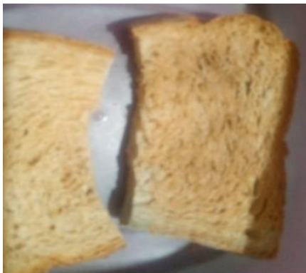
Fig4: Validation of anti-fungal properties

The above figure clearly demonstrates that natural product is far more effective than the artificial product.