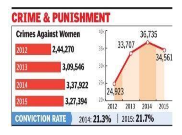
Fig 1. Crime against women statistics

is a smart women safety system using Radio Frequency Identification (RFID) and Global positioning system (GPS) [3]. It is packed with features for both everyday safety and real emergencies. This device will provide the fastest and simplest way to get the nearest help. Women have to do a single click and all features of this device start functioning, the main idea here is using an active RFID tag with a passive RFID reader to scan the information and this information is transferred to the microcontroller. Once the information is received by the controller, it sends the message to the contacts through the GSM module and the location is tracked through the GPS. We are using programming on Raspberry Pi with Python. This paper also summarizes other significant works in this field and hence forth discussed our device in a greater detail. The two primary equipment parts of this gadget is an Arduino Uno microcontroller and a GSM module.