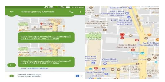
Fig 5. Device sends coordinates to recipient

As this mode is initiated by the press button, it takes 7 seconds to acquire the directions and messages are sent to the confided in contacts inside interims of 4 seconds. The message contains a hyperlink which coordinates the beneficiary straightforwardly to google maps where the area of beginning of the pain message will be shown.