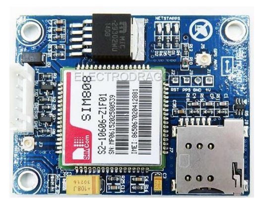
Fig3. Sim808 GSM module

The GSM module utilized is a [8] SIM808 module. It is a GSM/GPRS module with quad band which performs satellite correspondence utilizing GPS innovation. Both GPRS and GPS are coordinated into a smaller SMT bundle along these lines sparing both time and cost for clients utilizing the module to create applications. It includes an industry-standard interface and that permits the following of variable assets at any area consistently.