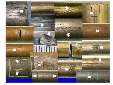
Fig.3.Coiled tubing failure diagram[10]

5. small footprint, fast handling and installation, cable can be built, automatic control and measurement while drilling, improve drilling safety, reduce operators and reduce drilling costs.