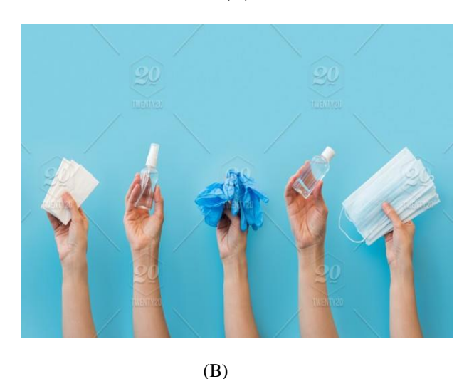
Fig 1:2; -: (A) Coca Cola; Taste the Feeling Advertisement for Indian Consumers vs (B) Health and hygiene products. Here in this picture we see, consumers are now more concerned with buying health hygiene products than pleasure aerated drinks which defines change of buying behavior.

Measurements of attitudes: Semantic Diffential Scale