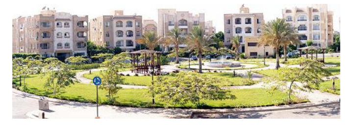
Fig. 3. Beverly Hills project in Sheikh Zayed City

In case the project has been already built, NUCA can recapture part of the land which happened in Beverly hills project in Sheikh Zayed when NUCA confiscated 50% of land (Fig. 3) or, NUCA can take over the ownership of the assets in terms of residential units or buildings which happened in the Nassaiem project in 6th of October city (World Bank, 2006). To sum up, NUCA has set certain mechanisms to dispose the land in new urban communities to the real estate investors. The investor, whether an individual or a company, has the right to apply for the land through official application includes required supporting documents to ensure his capability and commitment to develop the land. Once the investor's request is approved, an agreement is made between NUCA and the investor to determine the implementation schedule and the financial issues related to the land. Then, a legal document (Takhsis) is issued under certain agreed conditions. Failing to commit to this agreement can end up canceling the ownership.