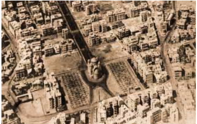
Fig. 1. Aerial view of Heliopolis in 1929

This trend changed in the 1990s when a new approach for the