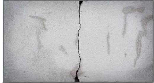
Fig. 4. (a) Medium crack (1-2mm)