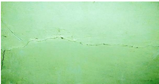
Fig. 3. (b) Thin crack (<1mm)

The cracks seen in Fig. 3 are thin cracks with less than 1mm in width. These cracks generally do not cause any