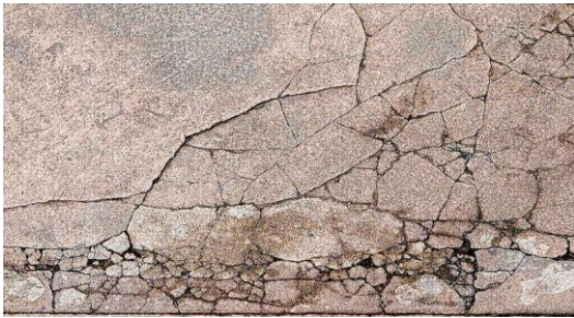
Fig. 2. Non-Structural cracks

such as cracks after hardening (Physical, Chemical, thermal, structural which cover drying shrinkage, crazing, corrosion of reinforcement, alkali-aggregate reactions, cement carbonation, freeze, and early thermal contraction) and cracks before hardening (plastic and constructional movement which cover early frost damage, plastic shrinkage and settlement, formwork movement and sub-grade movement). Non-structural cracks occur because of excessive internal forces developed in the material due to effects of gas, water content, chemical reactions, temperature variation, moisture variation, etc. The cracks in walls, parapet and compound walls, roofs, floor, and driveways are some examples of non-structural cracks. These cracks can be horizontal, vertical, and diagonal.