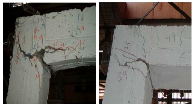
Fig. 1. Structural crack ( www.researchgate.net/figure/ )

Structural cracks occur due to extra loading, improper construction, and inaccurate design; they can lead to major safety issues of any construction. The cracks in beam, column, slab and foundation are the examples of structural cracks. Structural cracks can be horizontal, vertical, and diagonal. As Arvind Rajabather (2016) rightly classified structural cracks into three types such as cracks in beams (flexural, shear, torsional, corrosion cracks), cracks in column (horizontal, diagonal, corrosion cracks) and cracks in slab (flexural, shrinkage and corrosion cracks).