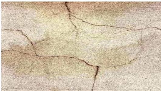
Fig. 3. (a) Thin crack (<1mm)