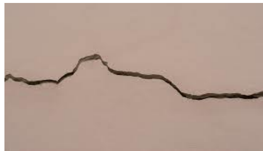
Fig. 5. Wide crack (>2mm)

The crack shown in Fig. 5 is of wide size with more than 2mm in width. These cracks appear very clearly visible and need an urgent repair. They mostly occur due to the soil settlement in foundation and elastic deformation of several structural parts of building.