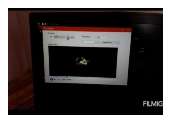
Fig.5. Result of video output screen

At first the video will be selected from source like computer /laptop/palmtop/mobile, etc in order to keep the thing to be transmitted ready. Then the transmitting side will work in accordance with the video that is needed to be transferred. The video will be sent to the PC of the transmitter side in and the video will be coded in a form to proceed for the further processing. Once the code is ready, it will be transferred to the converter where the video that is in coded form is converted to the light form. Then the data's are transferred to the receiver side when it is being placed within the range of the light. From there the coded video is decoded and then sent to the receiver output. And then the output is obtained on the source present on the receiver side.