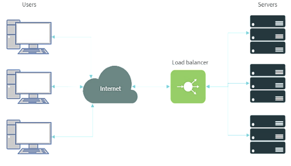
Fig1 – Load Balancing in Cloud Computing

Cloud load balancing is a technique for parting outstanding burdens progressively and consistently over various application servers running on cloud foundation. It would have been very difficult to manage the cloud technology not having the benefit of load balancing. It provides necessary redundancy techniques to make unreliable system reliable via managed redirection. Load balancing system can use a different mechanism to assign directions to various services. Simply load balancers are used to listen to network ports of the service request. Whenever we face mounting demand from users, load-balancers use the scheduling algorithm to assign where the request is sent.