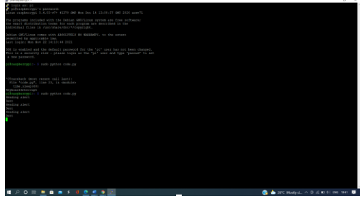
Fig -6: puTTY output

The main objective of this work is to model and develop a synergistic integration of mature technologies based on UAVs, stationary thermal/optical cameras assisted by a fire risk assessment model. In this paper, the development of an integrated forest monitoring system for early fire detection and assessment by using efficient hardware and software solutions is addressed. The proposed system could enable interested parties to react immediately, accurately and appropriately to a forest fire event.