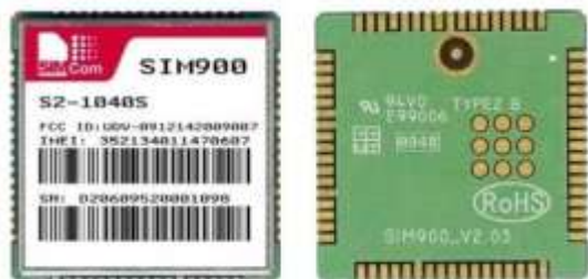
Fig 6. SIM900

Global System for Mobile Communication is recognised as a standard for digital cellular communication globally. GSM is a cellular network which connects to the cell phones which is registered. The GSM module used in this project is SIM900. AMR926EJ-S processor present in the module is the one which controls phone communication, data communication and the communication with the circuit interfaced with the cell phone itself. The module also has a SIM card holder where the SIM can be attached. A continuous energy (between 3.4 and 4.5 V) is supplied and absorbs a maximum of 0.8 A during transmission.