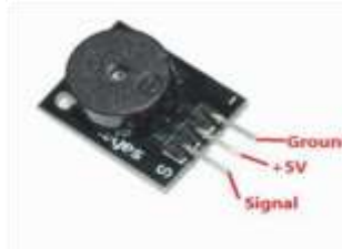
Fig 6. Buzzer

piezoelectric module which is responsible for high tone when the output is high. The working voltage is 5V. If the child is lost, the parent can locate the child by the loud sound produced by the buzzer. It can also acts as SOS signal to the people nearby that the child must be lost or in need of help.