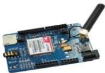
Fig 5. GPS module

The GPS (Global Positioning System) is a “constellation” of approximately 30 well-spaced satellites that orbit the Earth and make it possible for people with ground receivers to pinpoint their geographic location. The location accuracy is anywhere from 100 to 10 meters for most equipment. Accuracy can be pinpointed to within one meter with special military-approved equipment. GPS equipment is widely used in science and has now become sufficiently low-cost so that almost anyone can own a GPS receiver.